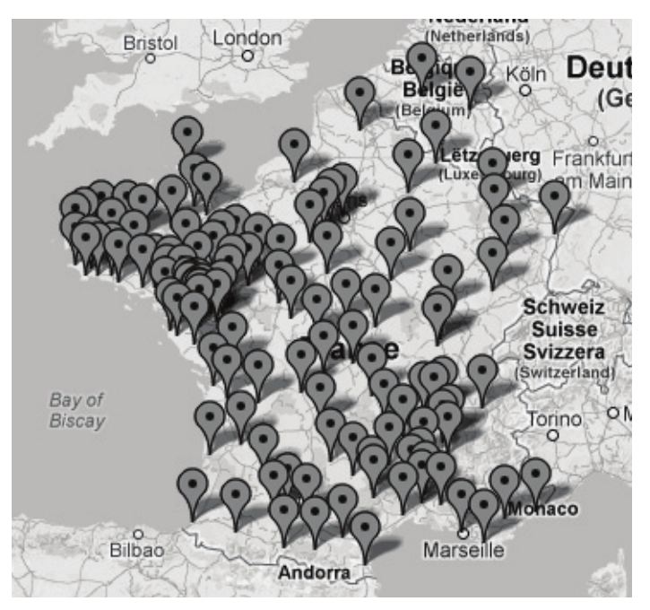
A map of ZAD support committees across France

<sup>23</sup> École national d'administration, a graduate school which trains senior French officials