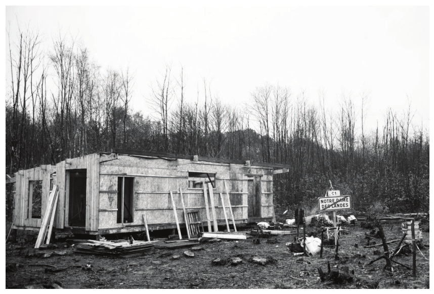
A building under construction by Rohanne forest, 18 November 2012

If the pressure momentarily lets up in the Châtaigne, vigilance remains appropriate in all the other occupied habitats, among others the house of the Sècherie (Fosses Noires road) which could be evicted as of 27 December and which is calling for mobilization.