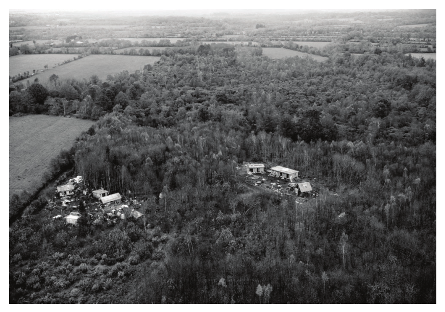
Squats in Rohanne forest