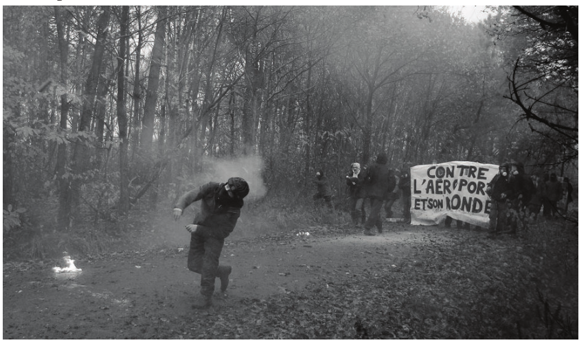
A zadiste throws back a police tear gas canister, 23 November 2012