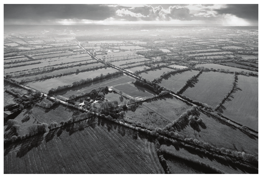
An aerial view of the ZAD