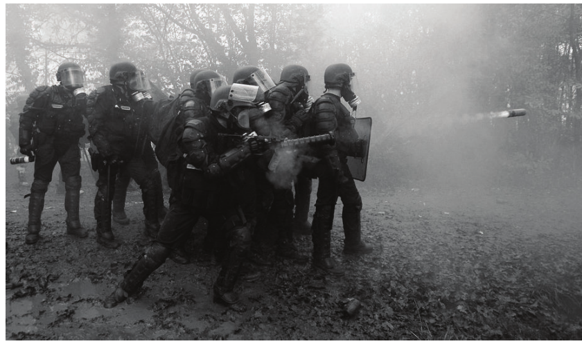
Mobile gendarmes attack opponents in the forest, 23 November 2012

So, from time to time it's worthwhile to say it again: we are in the process of winning, and on the other side they must be pretty bothered! Besides, one only has to read their pitiful declarations, exhorting good citizens to let the politicians think in their place, desperately waving the red flag of the ultra-left/anarcho-autonomous/whatever-frightens menace, trying again and always to divide opponents with calls to reason, coloring themselves regularly