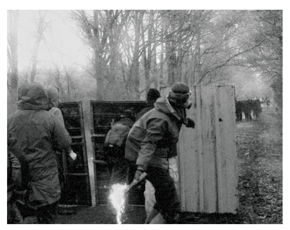
Against the Airport and Its World

It is time to bind ourselves definitively to the darkness, to stagnate still less beneath the spotlights, to relearn how to be everywhere at once.